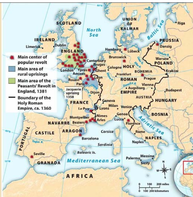
Map 11.3 Fourteenth-Century Revolts Chapter 11, A History of Western Society , Eleventh Edition Copyright © 2014 by Bedford/St. Martin's Page 344